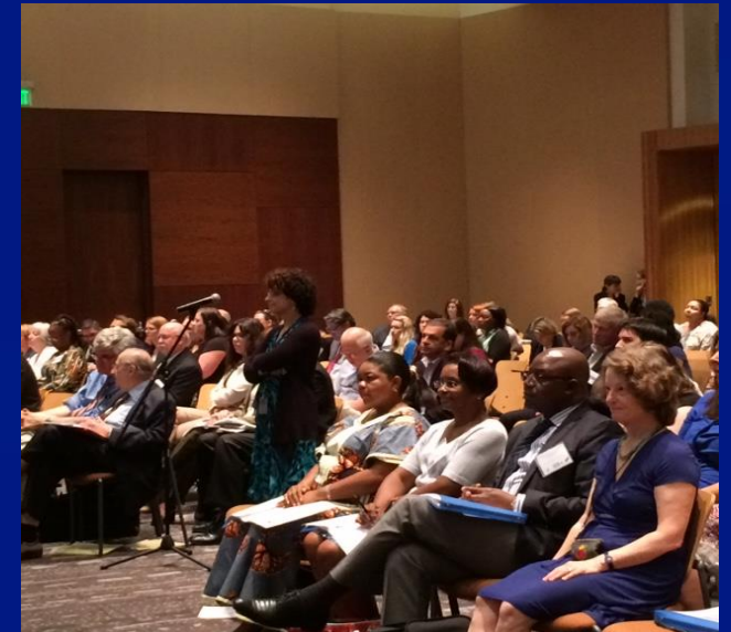
Public comment, ACIP June 2015