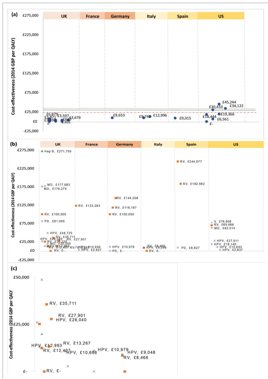
Figure 2. Cost-effectiveness by country per quality adjusted life year (QALY) of vaccinating the pediatric population against (a) influenza or (b) all other selected indications (rotavirus, pneumococcal disease, meningococcal disease, hepatitis B, human papillomavirus and varicella). A detailed view of cost/QALY between \leq 0 –50,000 in (b) can be found in (c). Willingness to pay (WTP) thresholds are represented by black (UK, \leq 30,000 ), red (remaining EU5 countries) and green (US) dashed horizontal lines. GBP Great British Pound, ICER Incremental cost-effectiveness ratio, EU5 European Union 5, Hep B Hepatitis B, HPV Human papillomavirus, MD Meningococcal disease, PD Pneumococcal disease, QALY Quality adjusted life year, RV Rotavirus, UK United Kingdom, US United States, V Varicella a Cost savings are denoted by \leq b ICER thresholds are represented by dashed horizontal lines for the UK (black —), US (green ---) and EU5 (red ---).

provided. Studies on MD 41–44 and PD 45–53 vaccination programmes followed birth cohorts (with the exceptions of Ortega-Sanchez et al. [2008] 42 [cohort of 11–17 year olds] and Trotter et al. [2002] 41 [0–17 years] for MD and Ray et al. [2006] 47 [cohort of < 5 year olds and > 5 year olds], Lieu et al. [2000] 48 [cohort of infants and young children], Ray et al. [2009] 50 and Diez-Domingo et al. [2011] 53 [cohort of <1 year olds], for PD) between 5 years and lifetime horizons. The primary effectiveness measures included cost per QALY, cases averted, and LYS.